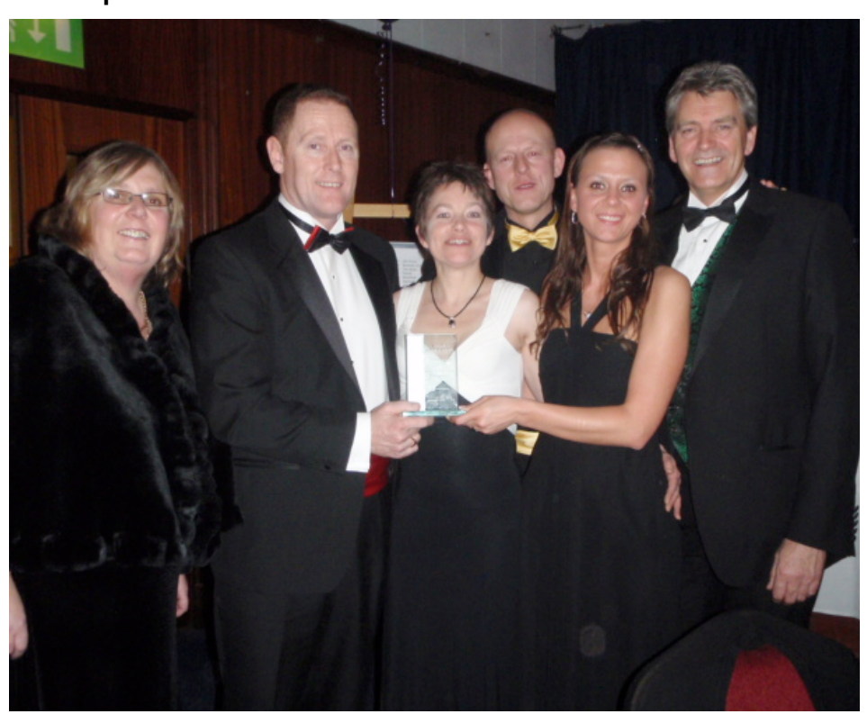
The News Business Excellence Awards Small Business of the Year 2012 – Runners Up